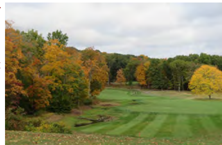
Shuttle Meadow Country Club Host of the CWGA Championship June 9—12, 2015