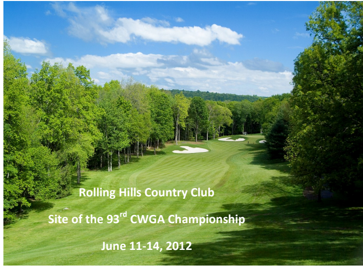
Rolling Hills Country Club Site of the 93 rd CWGA Championship June 11-14, 2012

Connecticut Women's Golf Association 179 Westledge Road West Simsbury, CT 06092